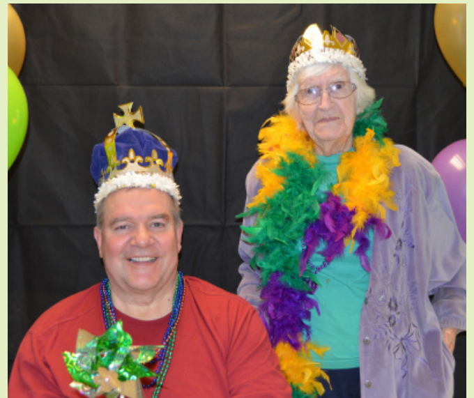
Say hello to our Mardi Gras King & Queen!