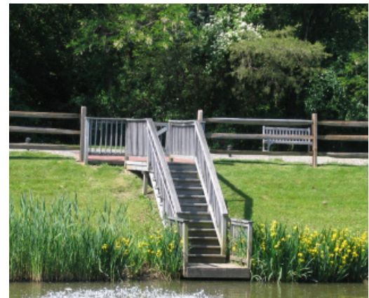
Example of the stairs to be built

The cost to complete the remodel of the building, construct a staircase and add a dock is approximately $18,000. Please consider giving a donation to off-set the cost of these new amenities, knowing that they will be utilized and enjoyed for years to come.