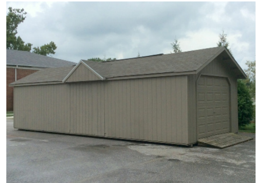
Future boathouse for the MHYC

A home for our Menno Haven Model Yacht Club and the addition of a staircase and dock to Reflection Lake is on its way to becoming a reality! A building, located behind the Renaissance at Chambers Pointe , is being remodeled in order to house and maintain our fleet of remote control sailboats. Once complete, the building will resemble a classic boathouse and will not only allow the fleet to be stored, but will give our sailors a place where they can work on the boats or engage in other boatbuilding projects. Menno Haven has 8 remote control sailboats, all donated, so anyone with the necessary knowledge to sail one is able to do so. This project will also include the construction of a staircase leading to the water's edge and a dock. Adding a staircase and dock to Reflection Lake will give our sailboat enthusiasts, as well as our fishermen, a safe way to access the lake.