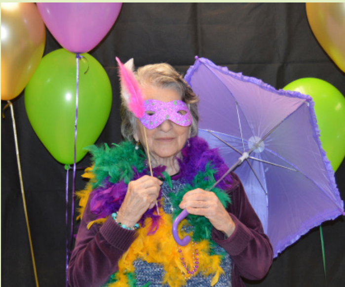
Our participants and team members brought in the Mardi Gras holiday in style!